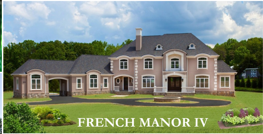
FRENCH MANOR IV