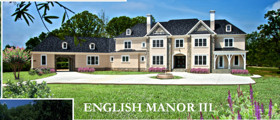
ENGLISH MANOR III

GO TO WWW.BOTEROHOMES.COM AND CLICK ON THE PICTURE OF THE HOUSE, FOR AN INTERIOR PHOTO GALLERY OF EACH BUCKINGHAM ESTATES HOME.