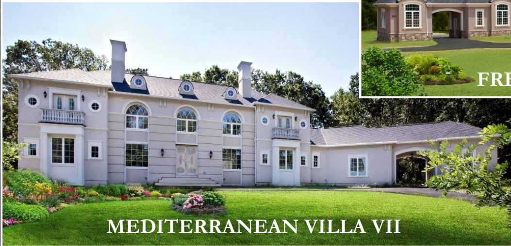
MEDITERRANEAN VILLA VII

GO TO WWW.BOTEROHOMES.COM AND CLICK ON THE PICTURE OF THE HOUSE, FOR AN INTERIOR PHOTO GALLERY OF EACH BUCKINGHAM ESTATES HOME.